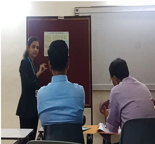
Winners of the 57 th National Pharmacy Week 2018-2019