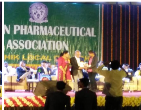
Winner of Scientific Rangoli