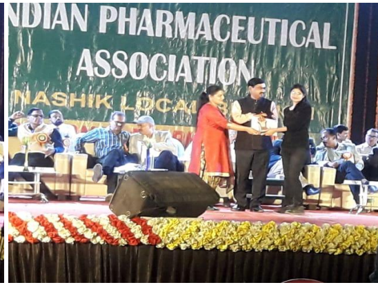
Winner of Solo Dance Competition