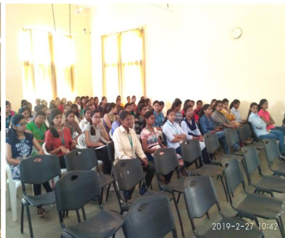
A Workshop on Skill Development Program on 27 February 2019