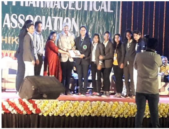
Winners of Skit Competition