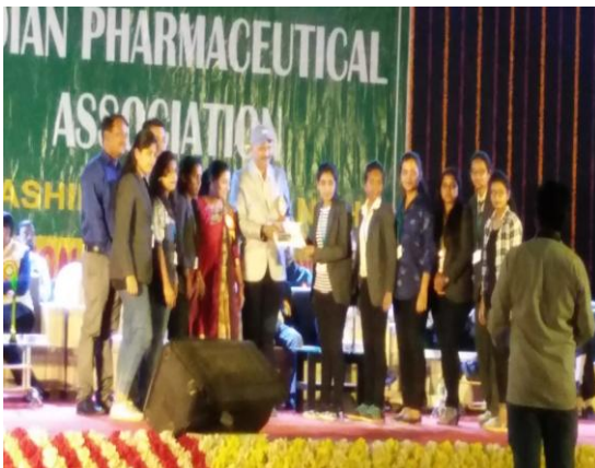
Winners of Throw Ball Competition