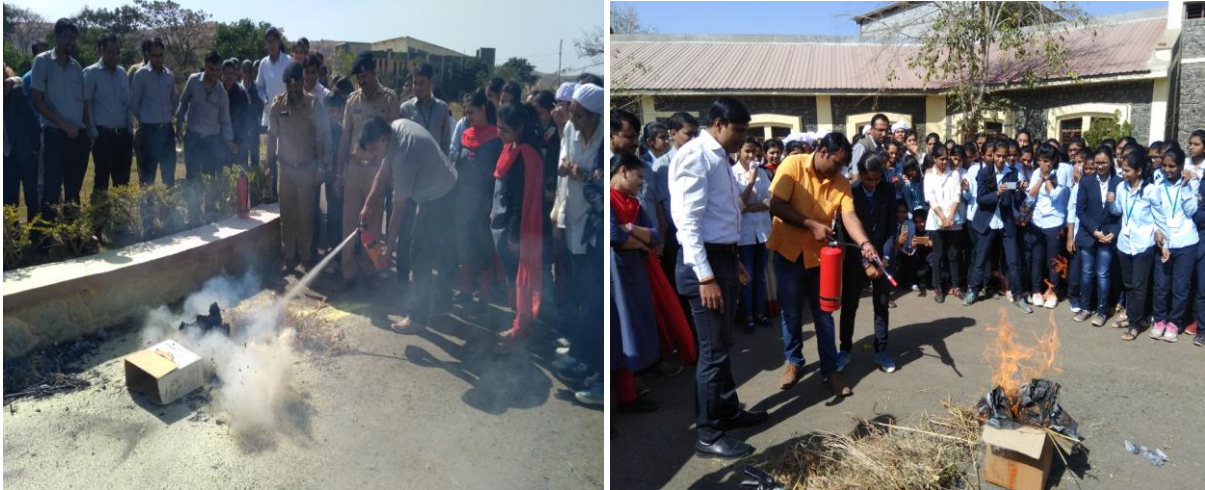
Workshop on Disaster Management on February 6, 2019