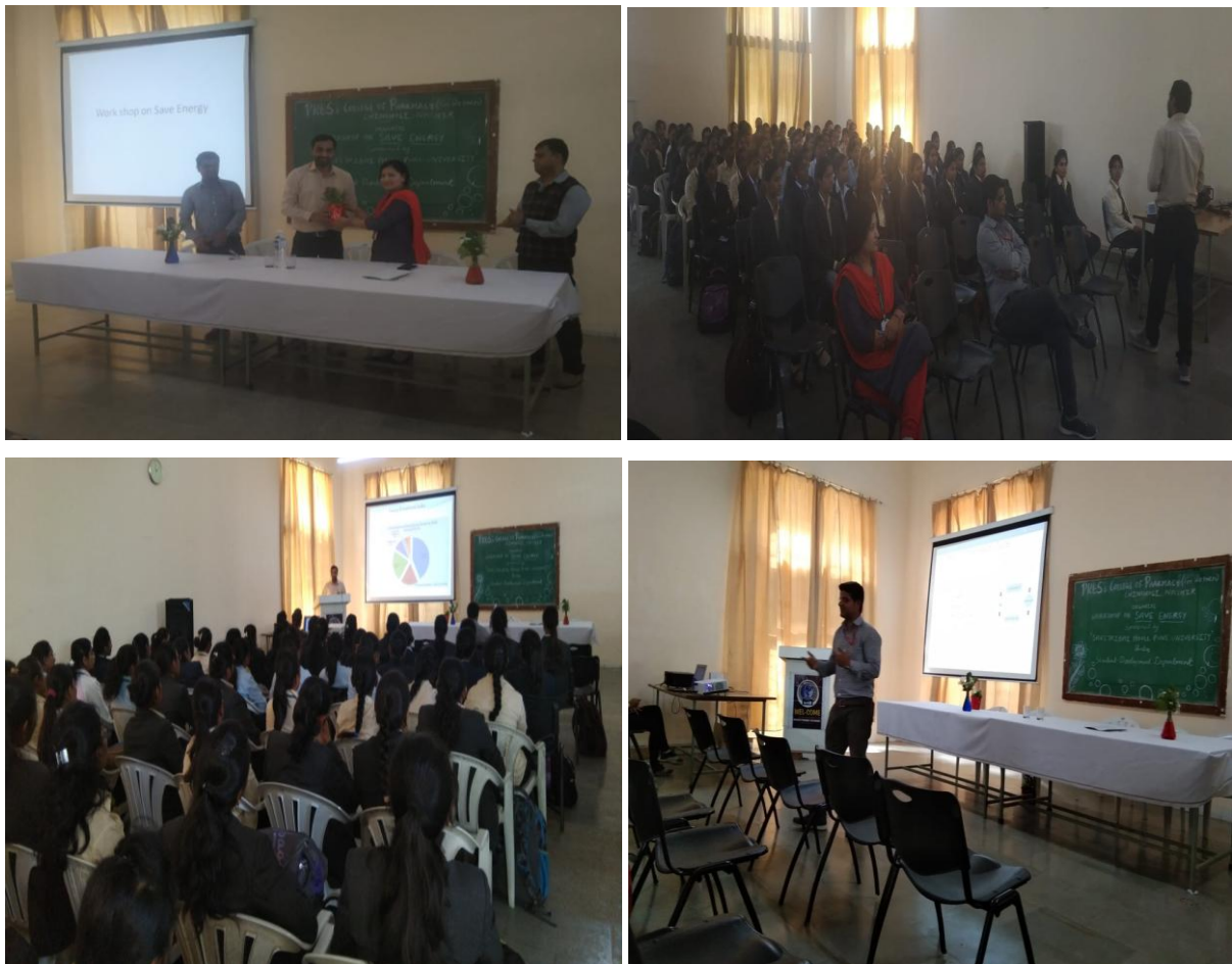
Workshop on Save Energy on February 4, 2019