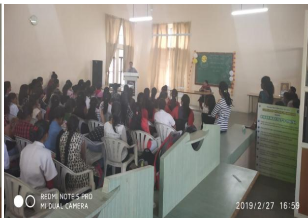
Celebration of "Marathi Bhasha Gaurav" Din on February 27, 2019