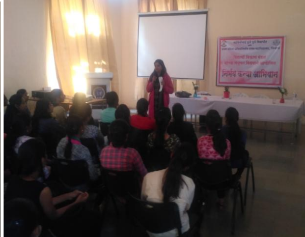
Seminar on Nirbhay Kanya Abhiyan on February 6, 2019